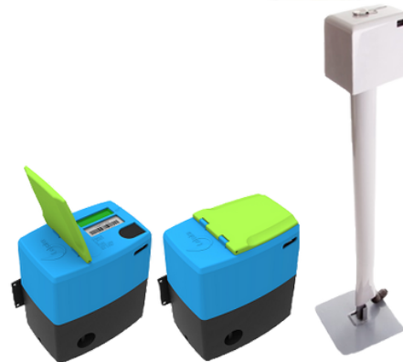
PRODUCT CODE: STP-WMM